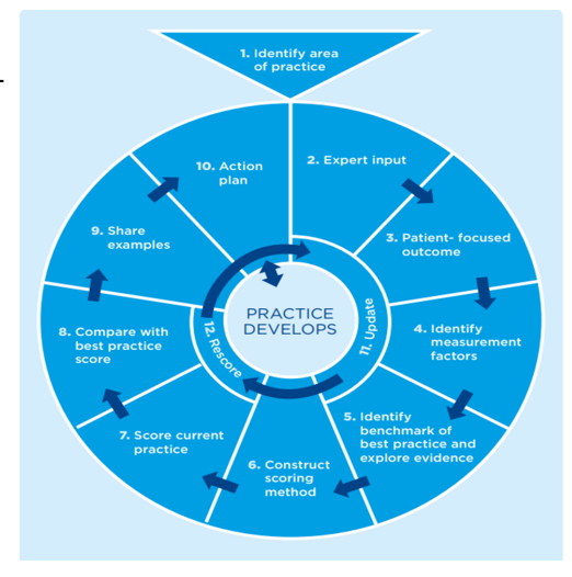
RCN Benchmarking Tool

The Regional Benchmarking Group meet quarterly to discuss results and QI projects and the group is currently reviewing the whole benchmarking process. Once the review has been completed it is anticipated that some of the units in SYB will begin to contribute to this activity, and hopefully some of you will be keen to get involved.